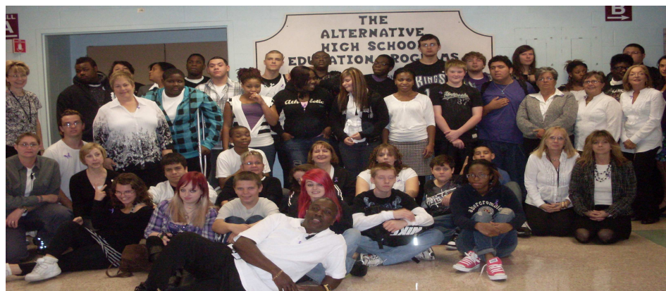
On October 20 staff and students wore black and white clothes and purple ribbons to show support of the Anti-Bullying campaign.